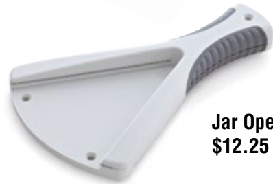
Jar Opener $12.25 value

use one for the kitchen, one for the bathroom