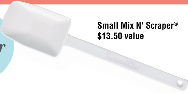
Small Mix N' Scraper® $13.50 value