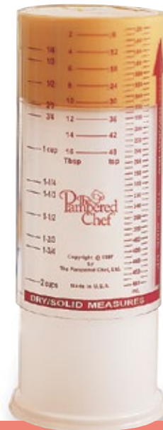
Measure-All® Cup $11.75 value

ask your consultant about recipes, product discounts, and more!