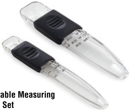
Adjustable Measuring Spoon Set $9.50 value