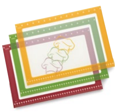
Flexible Cutting Mat Set $17 value