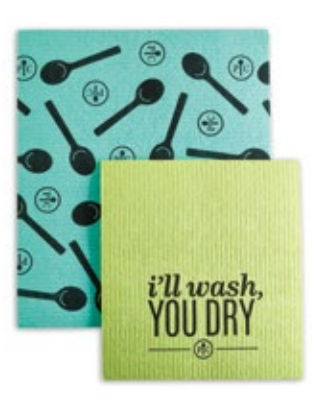
Everyday Cleaning Cloths $8.50 value