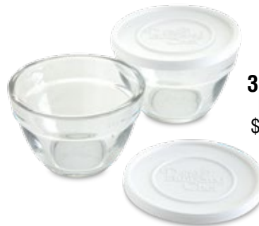
3-Cup Prep Bowl Set $20.50 value