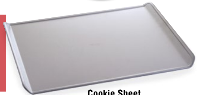
Cookie Sheet $19 value