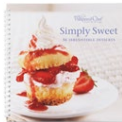
Simply Sweet cookbook $21 value #RQ60