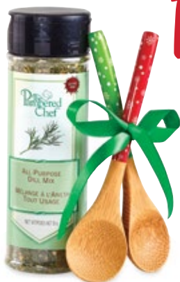
A. All-Purpose Dill Mix #9713 $8.50 (P) (K)