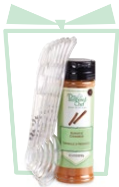
A. Measuring Spoon Set #2308 $10.25 ① (DWS)