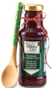
C. Small Green Bamboo Snowflake Spoon #1223 $4.25 ① (DWS)