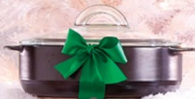
A. rockcrock® Everyday Pan #3139 $132.00 ⑤ (DWS)