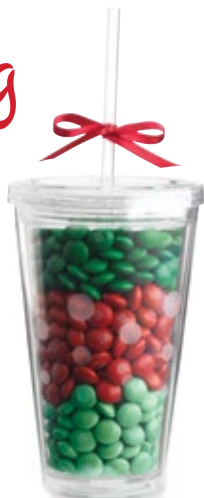
E. Double Wall Tumbler #2328 $12.00 ①