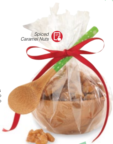
Spiced Caramel Nuts