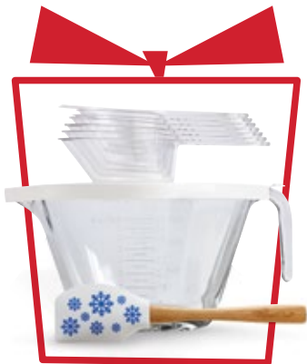
D. new Blue Snowflakes “Let It Snow” Scraper #1291 $11.50 ① (DWS)