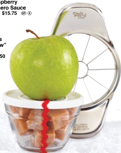
H. Apple Wedger #2427 $19.50 ③ (DWS)