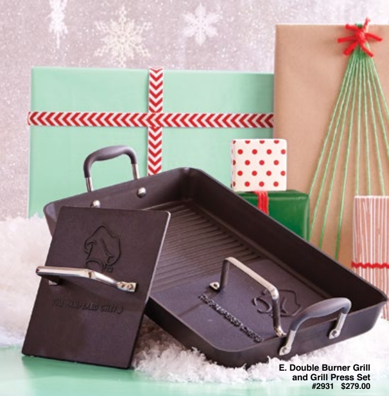
E. Double Burner Grill and Grill Press Set #2931 $279.00