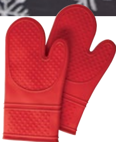
A. Silicone Oven Mitt Set Set of two. #1367 $38.50 ①