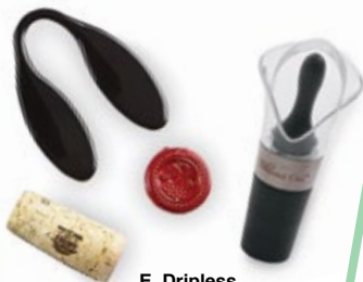
E. Drippless Pourer/Stopper #2158 $14.00 (3) (DWS)