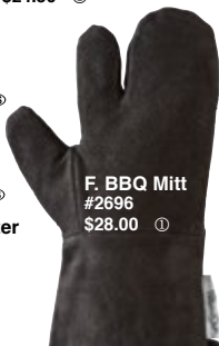
F. BBQ Mitt #2696 $28.00 ①