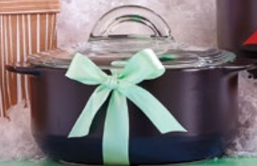
C. new rockcrock® Casserole #3141 $117.00 ⑤ (DWS)