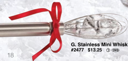
G. Stainless Mini Whisk #2477 $13.25 ③ (DWS)