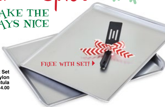
A. Cookie Sheet Set with Free Mini Nylon Serving Spatula #1522 $44.00