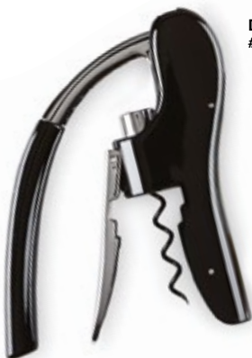
D. Wine Bottle Opener #2199 $41.50 (1)