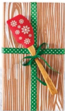
F. new White Snowflakes “Let It Snow” Scraper #1283 $11.50 ① (DWS)