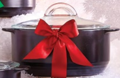
B. rockcrock® Dutch Oven #3140 $157.00 ⑤ (DWS)