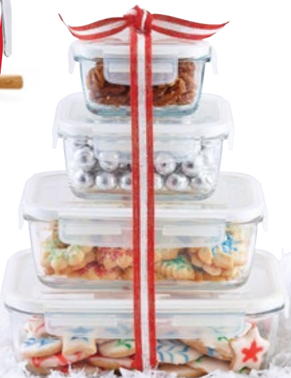
H. 8¼-cup (1.9-L) Rectangle 8¾" x 6" x 2¾" (22.5 cm x 15 cm x 7 cm). #1204 $26.00 ① (DWS)