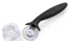
Pastry Cutter #1684 $13.25 ③