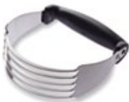
new Pastry Blender #1686 $10.00 ①