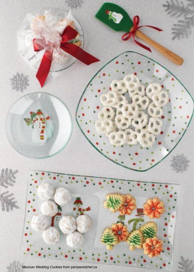
Mexican Wedding Cookies from pamperedchef.ca