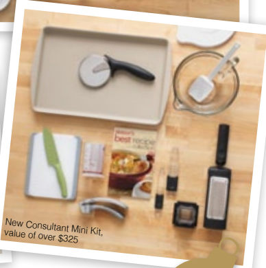
New Consultant Mini Kit, value of over $325