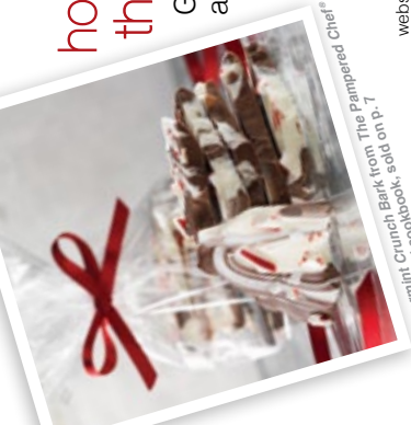
peppermint Crunch Bark from The Pampered Chef® Simply Sweet cookbook, sold on p. 7

Gift ideas and recipes at pamperedchef.ca