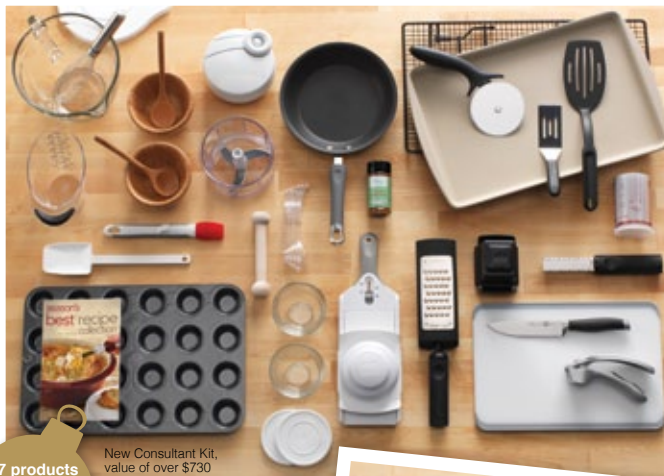
New Consultant Kit, value of over $730