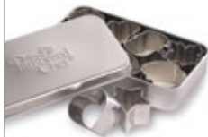
Creative Cutters Set #1095 $16.00 ③